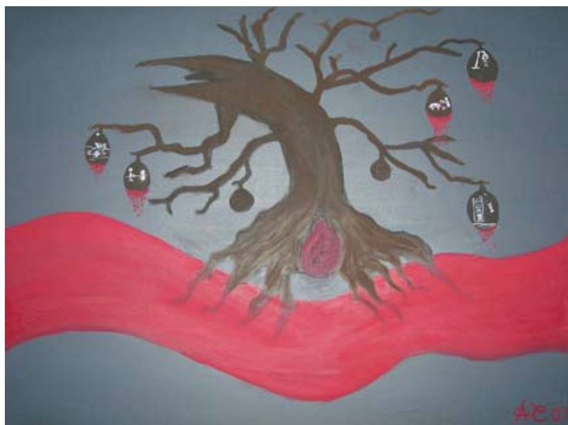
Allen Casteneda, "Earth Uprooted"