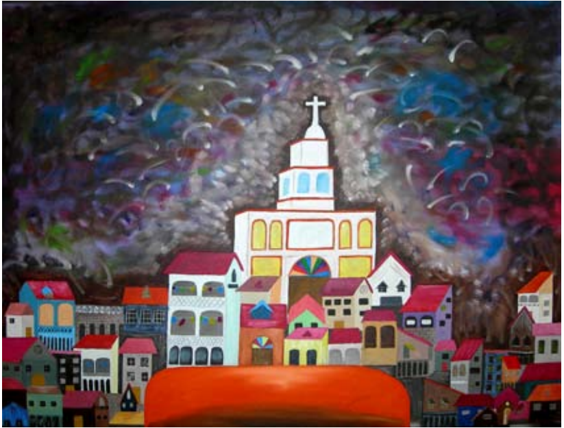
Jhinson Montaleza, "Dream City: Celebration"