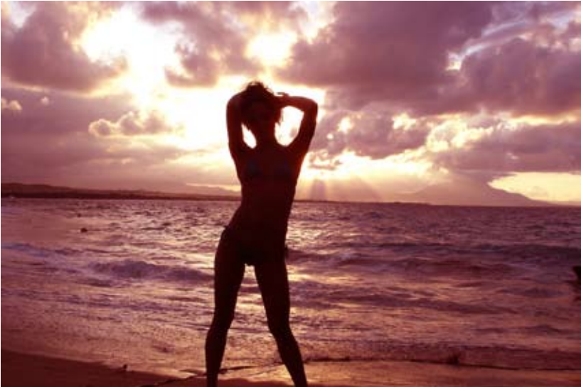
Raphael Rodriguez, "Beach"