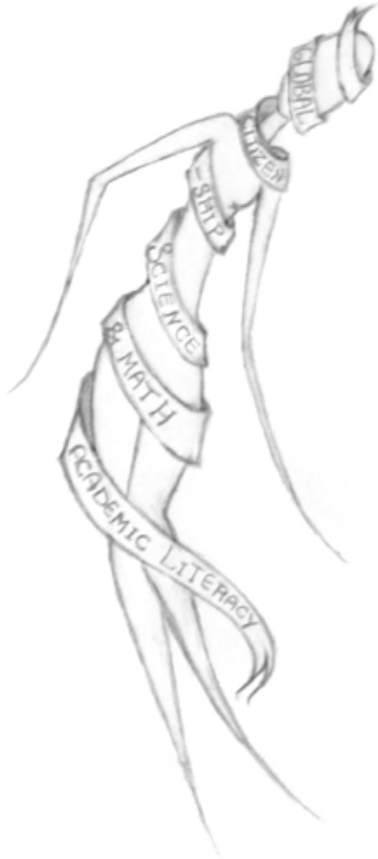
Bien Pocorni, Third Place, GenEd Contest