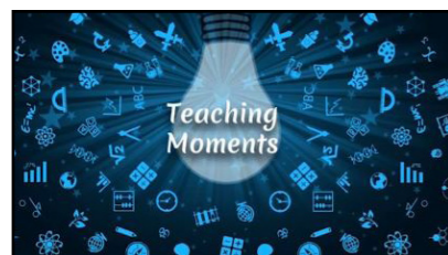
STUDENT EXPERIENCES SPRING 2020 HOSTOS COMMUNITY COLLEGE TEACHING MOMENTS