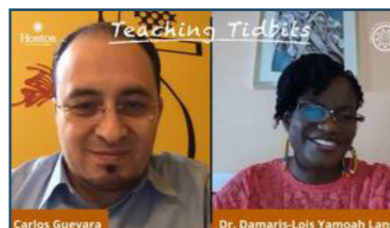
PROF. DAMARIS-LOIS YAMOAH LANG TEACHING TIDBITS: GAIN INSIGHTFUL TIPS WITH REMOTE LEARNING – EPISODE 1