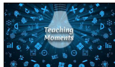
FACULTY EXPERIENCES SPRING 2020 HOSTOS COMMUNITY COLLEGE TEACHING MOMENTS